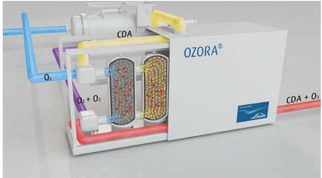
Illustration of OZORA's adsorption and desorption process.